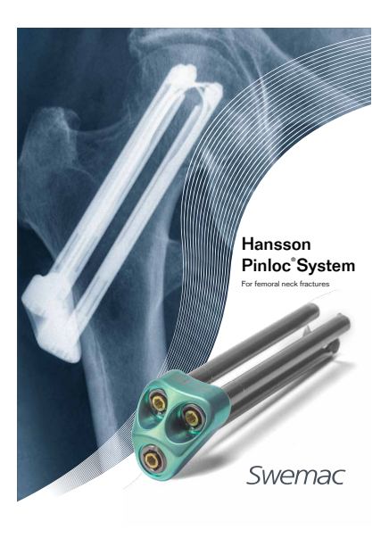
Illustration I The original Hansson pin.